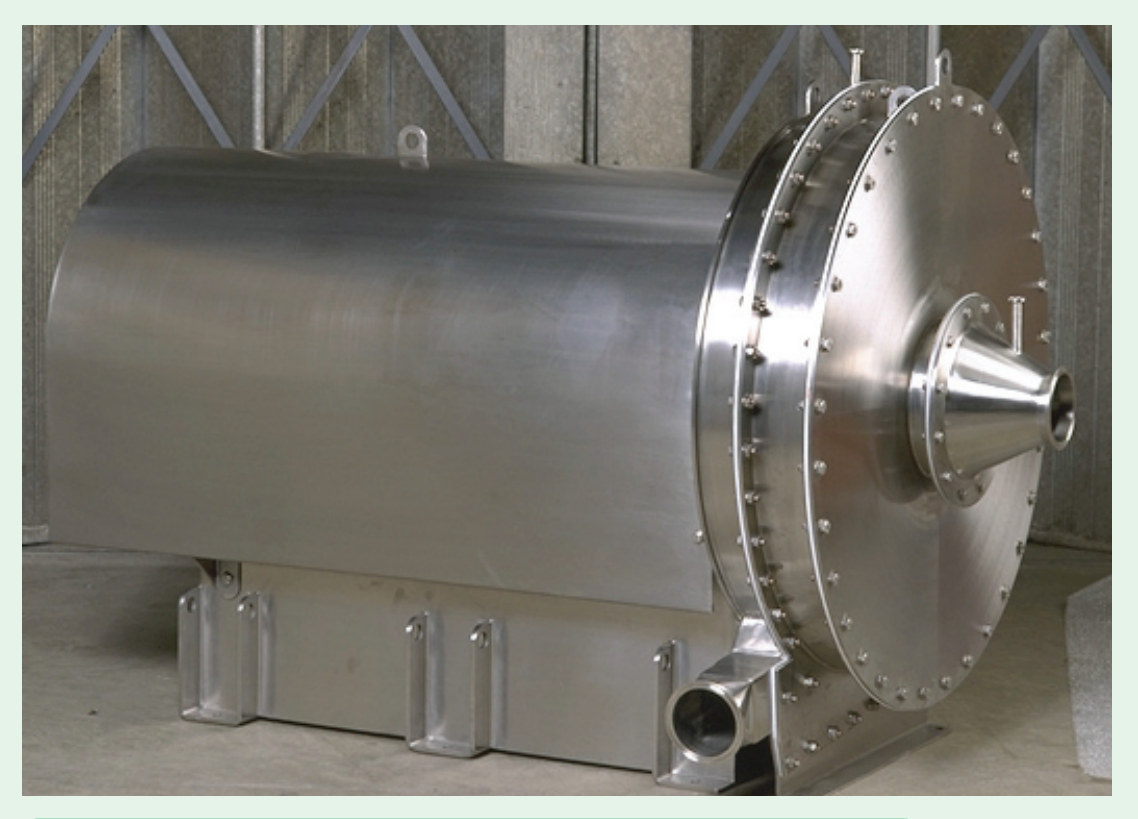
Halifax two-stage fan assembly, encased with a removable, polished, stainless steel shroud.

Halifax Fan is no stranger to the high-specification demands of the pharmaceutical industry and, recognized for the quality of its engineering, is frequently called upon for bespoke solutions to demanding applications.