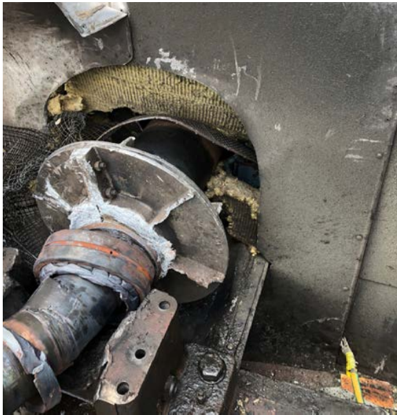
Bearing failure – lost lubrication.