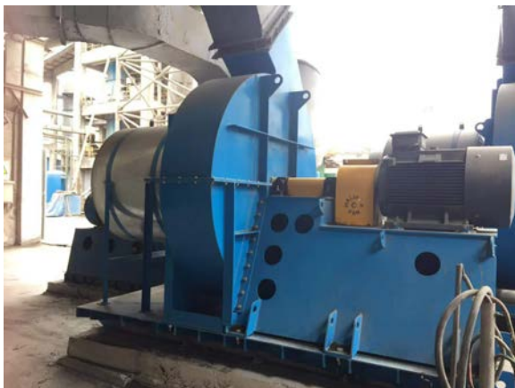
Cement cooler fan – plummer block bearings.

Spherical roller bearings and self-aligning ball bearings have a spherical outer race to allow the bearings to align themselves to each other. The inner race has to be concave, which means that one row is unloaded with an axial load. Therefore, these bearings employ two rows of the rolling elements. Although spherical roller bearings and self-aligning ball bearings have a tolerance for lack of concentricity, it is not very large. This is due to the effect of misalignment on the bearing shaft seals and the movement that can happen within the bearing.