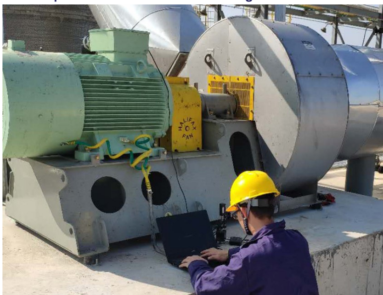
Assessing bearing vibration.

Rolling element bearings are the main bearing types used for fans. They have their challenges but with proper design and maintenance, can give years of good fan service. ■