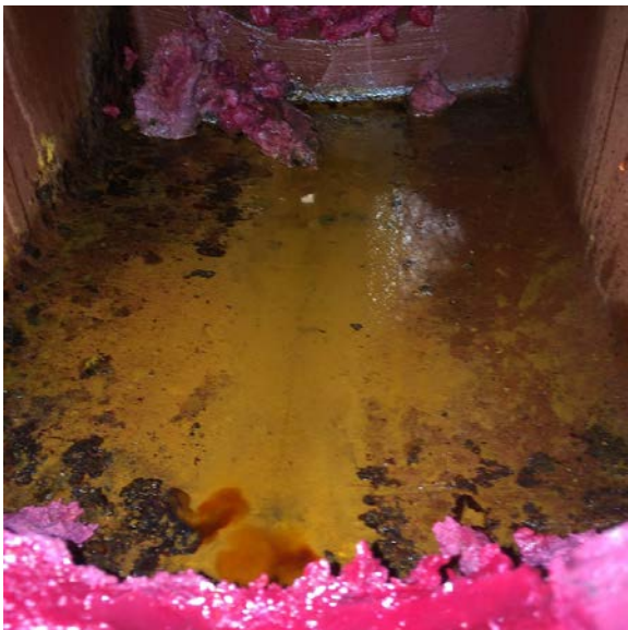
Red bearing grease turned pink by water contamination – water in the bottom of the bearing housing.