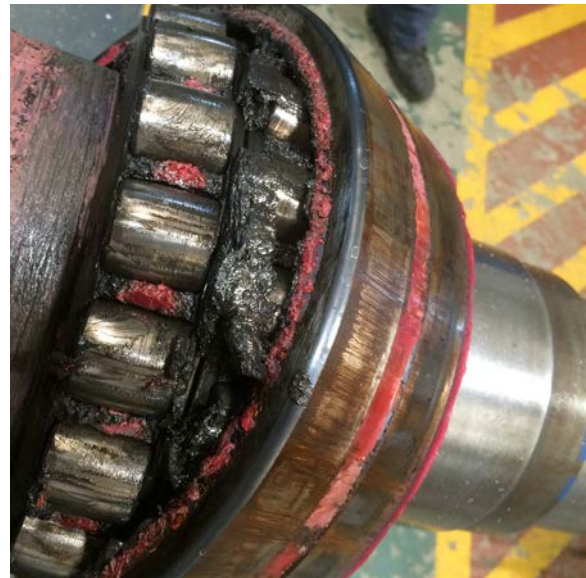
Spherical roller bearing – grease black from wear.

Although oil has advantages, it also has a major disadvantage. It is difficult to retain the oil in the