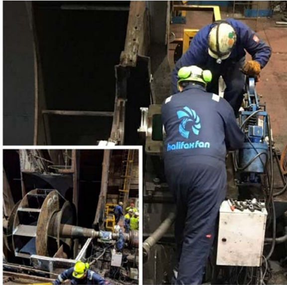
Large rotor being installed on site – oil film bearings.

Some designs of deep groove ball bearings and roller bearings have a spherical outer surface and sit in a housing with a matching spherical surface. This allows the bearing to swivel in the housing to give concentricity. The most common type of bearing using this technique has a saddle housing, with the bearing protruding beyond the housing. Split roller bearings use rollers to maximise bearing life so are one of the main types of bearing with a spherical seat. With a spherical seat, the bearing seal has to be part of the bearing.