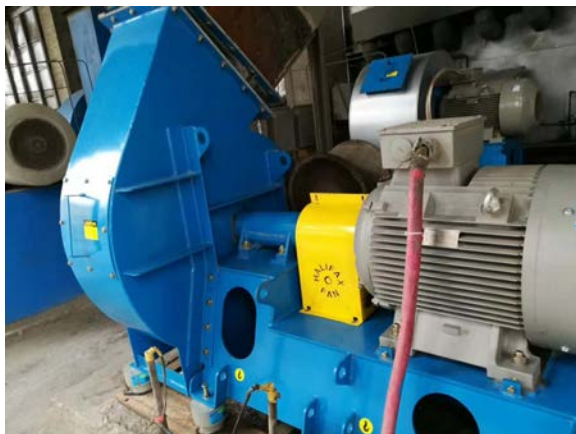
Cement cooler fan – monoblock bearing unit.