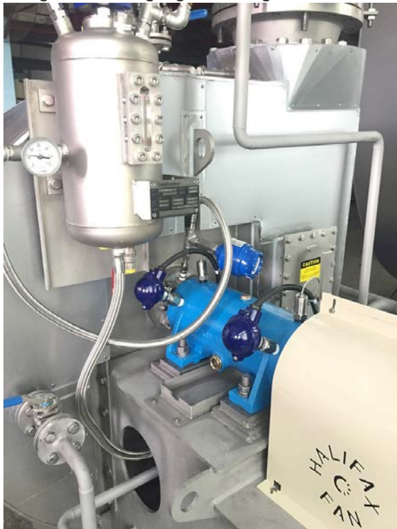
ATEX Fan – Mechanical shaft seal, bearing unit with temperature and vibration monitoring.

skidding due to light loading of bearings. The vibration of shafts whirl like a skipping rope. Forward whirl is driven by out of balance and occurs in the direction of the shaft rotation. Reverse whirl is driven by skidding and moves in the direction opposite to the shaft rotation. Typically, the reverse whirl mode is not considered due to the fact that it is only weakly excited by being out of balance, so can be close to running speed. This becomes a problem when there is excessive bearing skidding and can lead to high vibration levels at running speed. When this happens, the solution is usually to change to a bearing that can take the light load without skidding. For example, a spherical roller bearing may be changed to a self-aligning ball bearing.